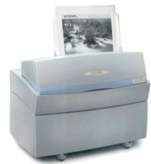
Plate developer. Water from developing plates cleaning